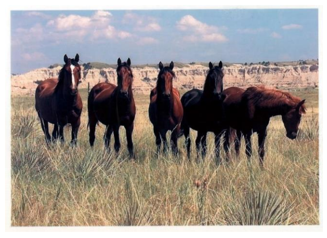
White Sands Bachelors

In 2010, ISPMB completed eleven years of behavioral studies on the four herds aforementioned. With this data in hand, ISPMB began to prepare the first "model for managing" America's wild equids in a manner that is conducive with their survival and compatible with maintaining their natural healthy behaviors. Yet, another seven years ensued in analyzing observations and adding to ISPMB's management model the deleterious effects of the birth control drug, Porcine Zona Pellucida (PZP), which was administered to the Catnip and Virginia Range herds.