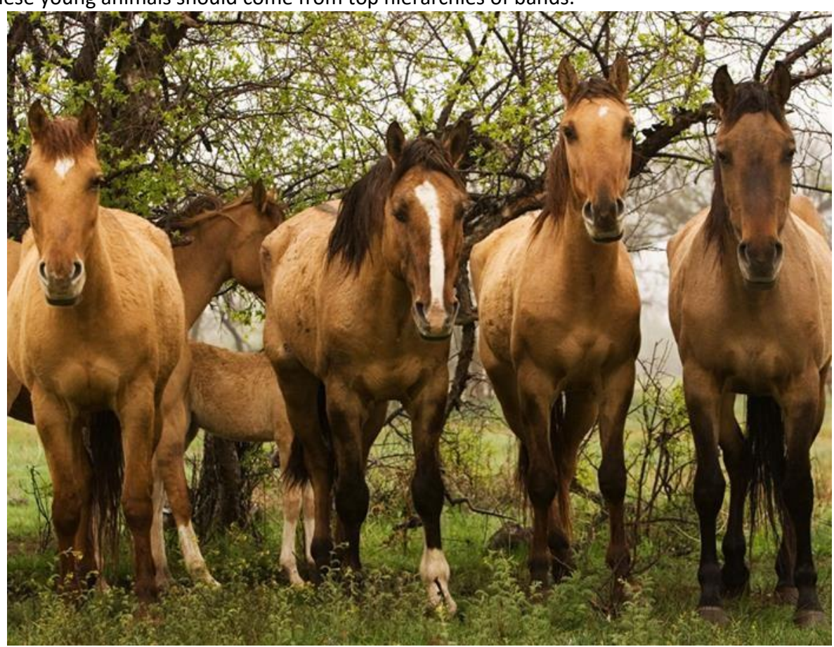
Family Band of the Gila Wild Horse Herd

A sufficient number of young animals should be maintained in the herd to offset mortality. These young animals should come from top hierarchies of bands.