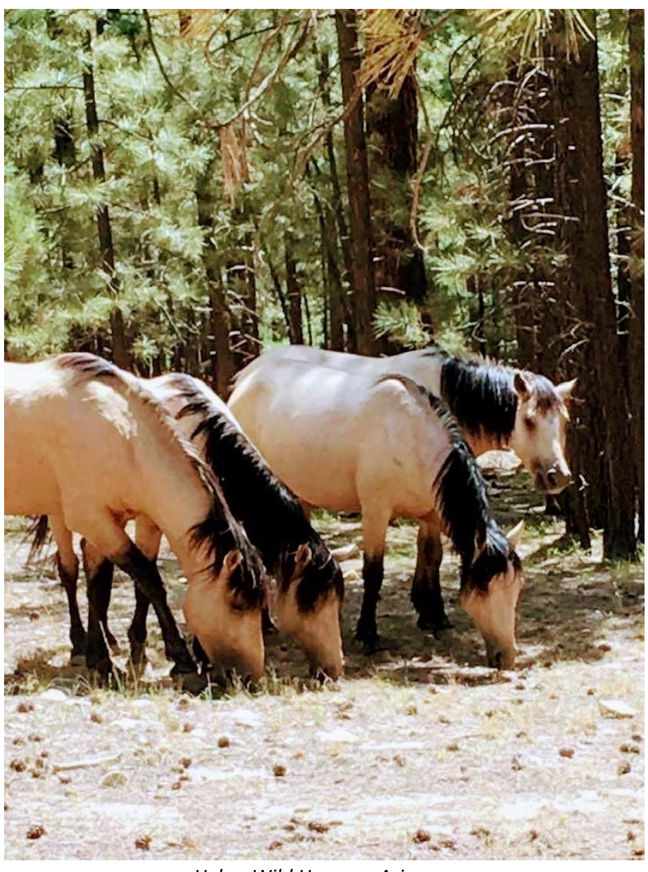
Heber Wild Horses - Arizona

We expect that this herd could transform the management of all wild horses and burros on public lands. This herd represents what the Wild Horses and Burros Act declared for the horses "protected from capture, branding, harassment, or death; and to accomplish this they are to be considered in the area where presently found, as an integral part of the natural system of public lands."