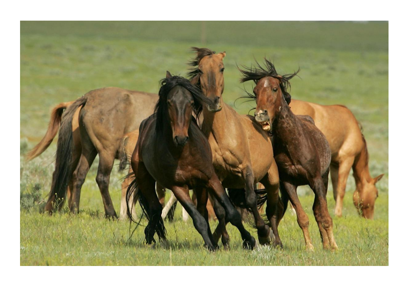
Gila Wild Stallions Chase Bachelor stallions while Mares graze in the Background