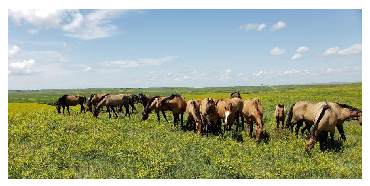
ISPMB's Gila Wild Horses

The oldest wild horse and burro organization in the United States and instrumental in the passage of P.L. 92-195, The Wild Free-Roaming Horses and Burros Act of 1971 (The Act.) The only organization in the U.S. to manage four herds of wild horses undisturbed for 17-years.