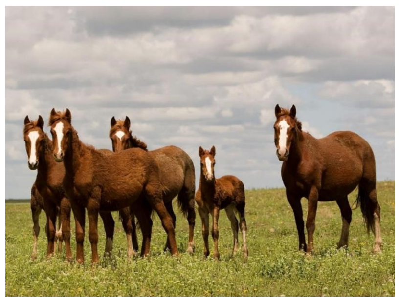
A Band of the Catnip Herd

It is the goal of the ISPMB that this management plan will give the Agencies the necessary tools to effectively manage wild horses and burros in a manner that protects and sustains their survival over the long-term; reduces the fertility and recruitment rates and the need for ever increasing removals; and restores the trust and credibility of the agency with the American people.