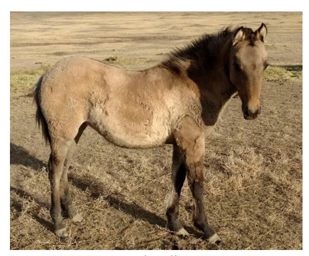
Gila Filly