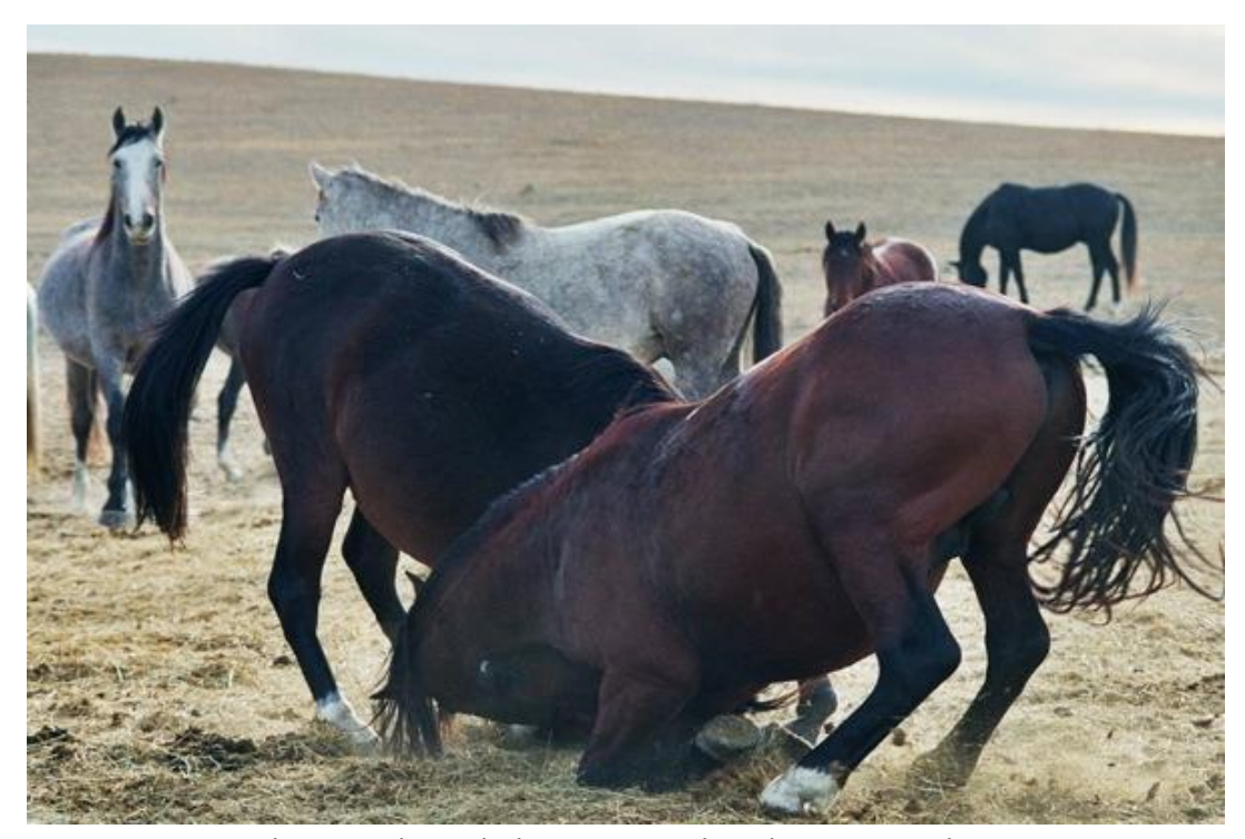
White Sands Bachelors in a Mock Fight

Finally, to end this cycle, BLM must no longer disrupt the social structures of the herds, and if removals are needed, that it must be done band by band either through bait or water trapping.